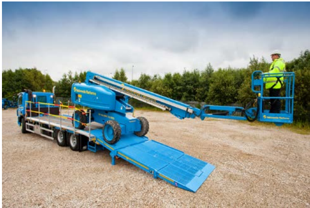
Low Loading Angle