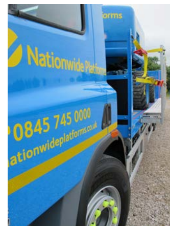
Walkway with Fall Protection