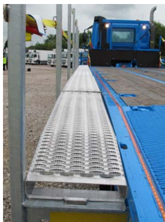
Driver Safety Walkway