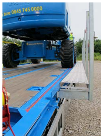
LED Safety Lighting