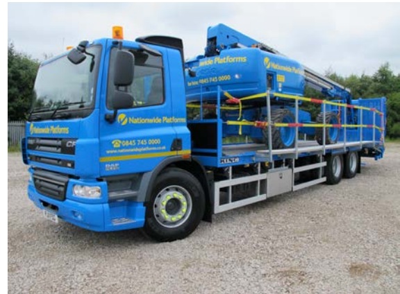
Hi Vis Handrail & Driver Fall Protection